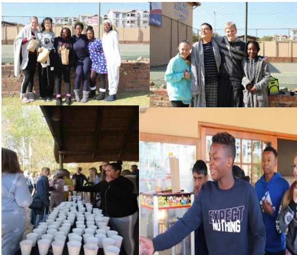
Movie and Pyjama Day!