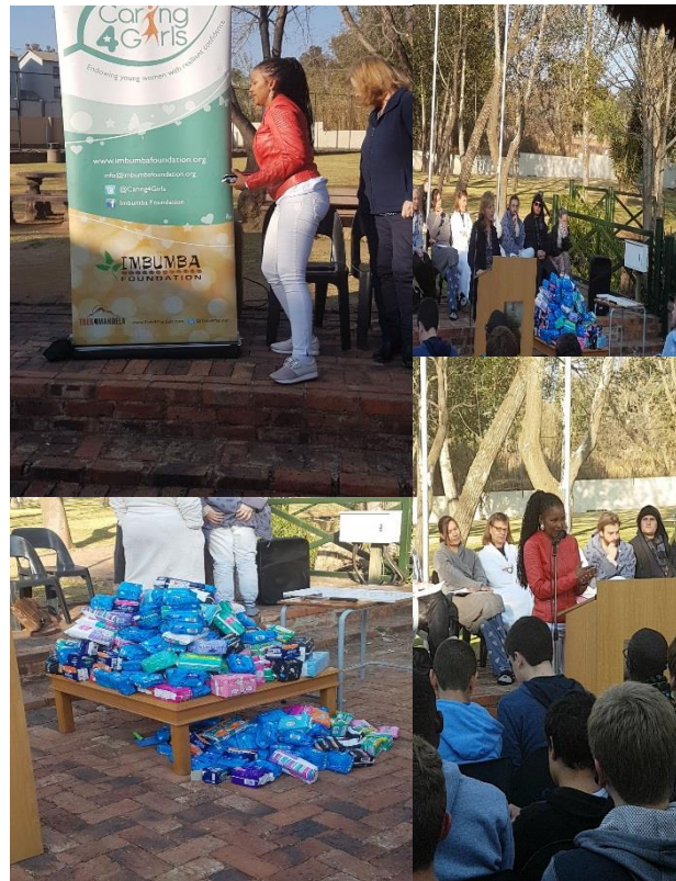
Caring for Girls!